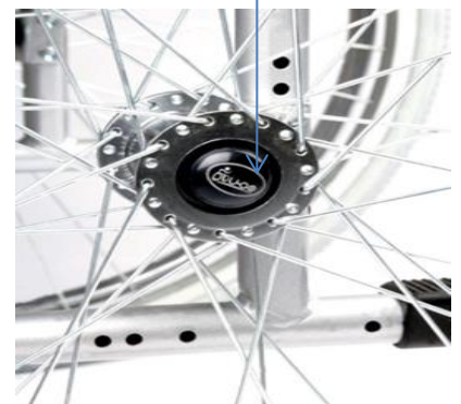
Quick Release Button

IMPORTANT: The wheelchair has not been tested as a seat in a motor vehicle. Users should always transfer to the vehicle's seat and the wheelchair should be safely stowed away.